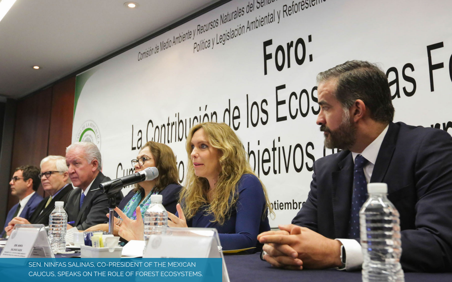
SEN. NINFAS SALINAS, CO-PRESIDENT OF THE MEXICAN CAUCUS, SPEAKS ON THE ROLE OF FOREST ECOSYSTEMS.