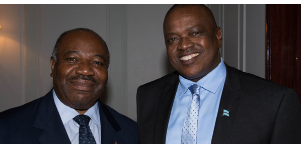
THE PRESIDENT OF GABON, THE VICE-PRESIDENT OF BOTSWANA & OTHER WORLD LEADERS IN NEW YORK

Special guests at the reception included His Excellency Ali Bongo Ondimba, President of Gabon; His Honour Mokgweetsi Masisi, Vice President of Botswana;