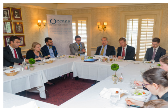
FIRST OF THE NATIONAL SECURITY BRIEFING SERIES: SCIENCE & TECHNOLOGY TO COMBAT OCEAN CRIME

To ensure that these issues are highlighted within the Congressional community, the Oceans Caucus Foundation is launching a National Security Briefing Series that will feature experts from the defense and maritime management communities to educate Congressional staff and the public and private sectors on the security threats posed by rampant ocean crime.