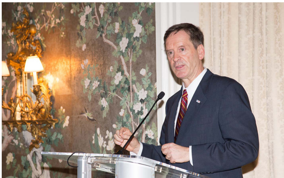
USAID ADMINISTRATOR, AMBASSADOR MARK GREEN, SPEAKS AT SEPTEMBER RECEPTION IN NEW YORK ON PUBLIC-PRIVATE PARTNERSHIPS

Panel of experts discusses the role of the private sector in addressing marine debris