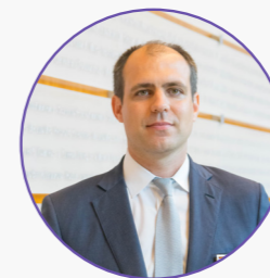
John Basil Gantt President, ICCF U.S.

More and more governments are recognizing the success of, and benefiting from, our parliamentary caucus model , first pioneered in the U.S. Congress and now being replicated in parliaments in Africa, Latin America, and Asia. Through these caucuses and our International Conservation Corps program - which provides technical assistance to national parks and protected areas around the world - we are driving strong results on a range of issues including combating wildlife trafficking, building the institutional capacity of national parks systems, and ensuring the sustainability of ocean resources.