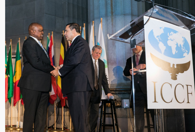
Representative Henry Cuellar, Co-Chair of the International Conservation Caucus, greets President of Botswana Mokgweetsi Masisi at the 2018 Gala.