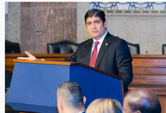
Costa Rican President Carlos Alvarado Quesada addresses Members of Congress at an ICCF Congressional Member Dinner on Capitol Hill.