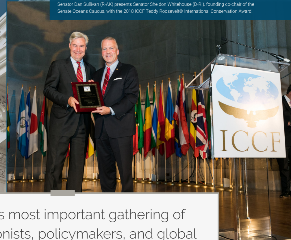
Senator Dan Sullivan (R-AK) presents Senator Sheldon Whitehouse (D-RI), founding co-chair of the Senate Oceans Caucus, with the 2018 ICCF Teddy Roosevelt® International Conservation Award.

The year's most important gathering of conservationists, policymakers, and global business leaders to celebrate leadership in international conservation.