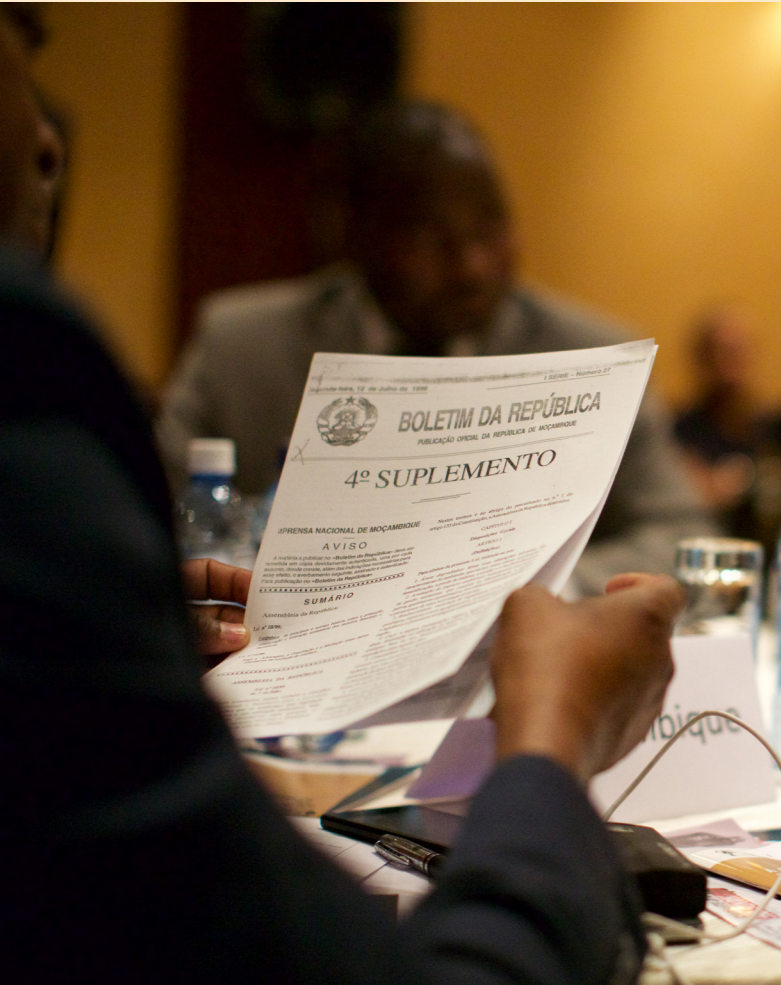
A Member of the Assembly of the Republic of Mozambique examines legislative text at an ICCF-facilitated workshop.