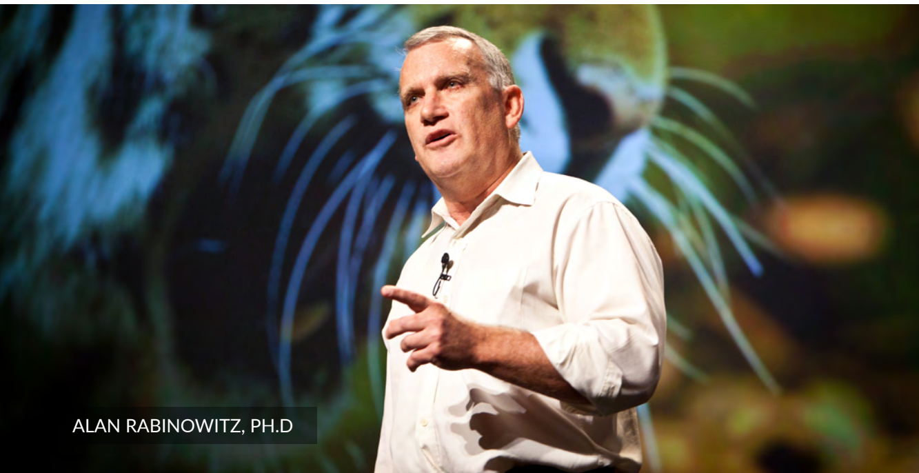
ALAN RABINOWITZ, PH.D