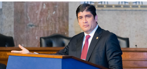
COSTA RICAN PRESIDENT CARLOS ALVARADO QUESADA ADDRESSES MEMBERS OF THE UNITED STATES CONGRESS

H.E. Carlos Alvarado Quesada, President of the Republic of Costa Rica, joined ICCF on June 12th on Capitol Hill to address members of the U.S. Congressional International Conservation Caucus and ICCF's business and NGO partners. In his address, the President spoke of Costa Rica's demonstrated commitment to protecting its wealth of natural resources, a successful model for balancing conservation and economic development. President Alvarado invited Members of Congress to "work together regardless of our differences and lead the world through accurate political decisions." Working together toward common objectives is key, the President stressed, adding that collaboration and innovation are necessary in order to adequately address global conservation challenges.